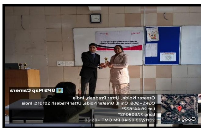
Students getting Certificates and Trophies for the completion of the workshop