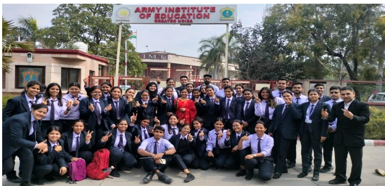
Glimpses of the “Employability Skill Programme” on 16 th -23 rd February 2024