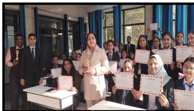
Students showing Certificates after completion of the workshop