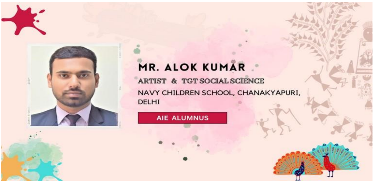
Flyers of the Workshop